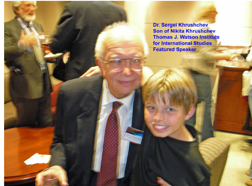
Dr. Sergei Khrushchev Son of Nikita Khrushchev Thomas J. Watson Institute for International Studies Featured Speaker